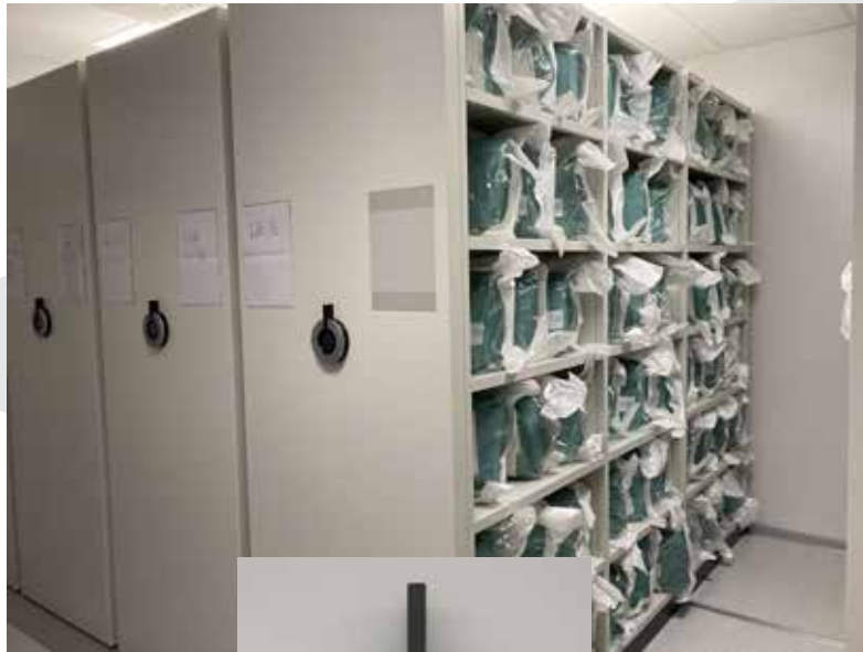
Electronically driven system

The mobile shelves are delivered with either a manually operated system or with our electronic user interface. It is possible to convert from a manual system to an electronically driven system.