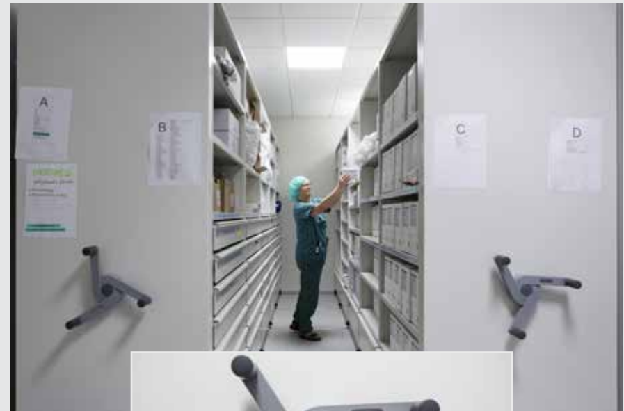
Manually operated system